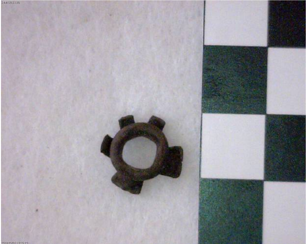
Brass shoe eyelet China Gulch, Unit 2, Level 1 (0-10cm)

IT IS ILLEGAL TO REMOVE OR HARM ANY HISTORICAL OR ARCHAEOLOGICAL MATERIALS ON PUBLIC LANDS.