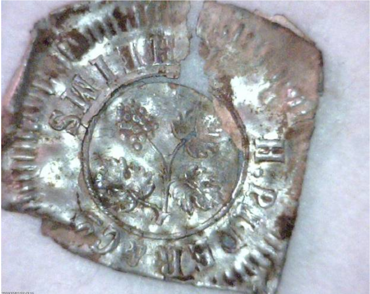
“H. Piper & Co. Rheims” Lead Foil Seal for Imported French Champagne or Wine Bottle China Gulch, Unit 2, Level 1 (0-10cm)

IT IS ILLEGAL TO REMOVE OR HARM ANY HISTORICAL OR ARCHAEOLOGICAL MATERIALS ON PUBLIC LANDS.