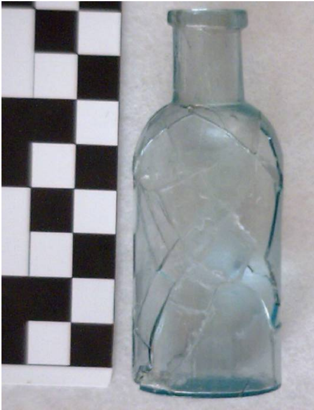
Small four-piece mold bottle (1850s-1870s) China Gulch, Hearth 4, Unit 1, Level 2 (10-20cm)

IT IS ILLEGAL TO REMOVE OR HARM ANY HISTORICAL OR ARCHAEOLOGICAL MATERIALS ON PUBLIC LANDS.