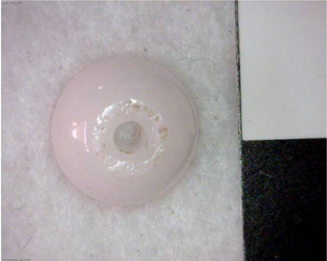
White porcelain bead China Gulch, Hearth 1, Unit 2, Level 1 (0-10cm)

IT IS ILLEGAL TO REMOVE OR HARM ANY HISTORICAL OR ARCHAEOLOGICAL MATERIALS ON PUBLIC LANDS.