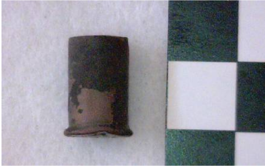
.32 Caliber Rimfire Casing. China Gulch, Hearth 1, Unit 2, Level 1 (0-10cm)

IT IS ILLEGAL TO REMOVE OR HARM ANY HISTORICAL OR ARCHAEOLOGICAL MATERIALS ON PUBLIC LANDS.