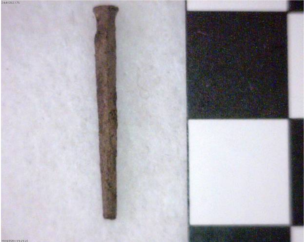
Small Finishing Nail or Shoe Tack China Gulch, Hearth 1, Unit 2, Level 1 (0-10cm)

IT IS ILLEGAL TO REMOVE OR HARM ANY HISTORICAL OR ARCHAEOLOGICAL MATERIALS ON PUBLIC LANDS.