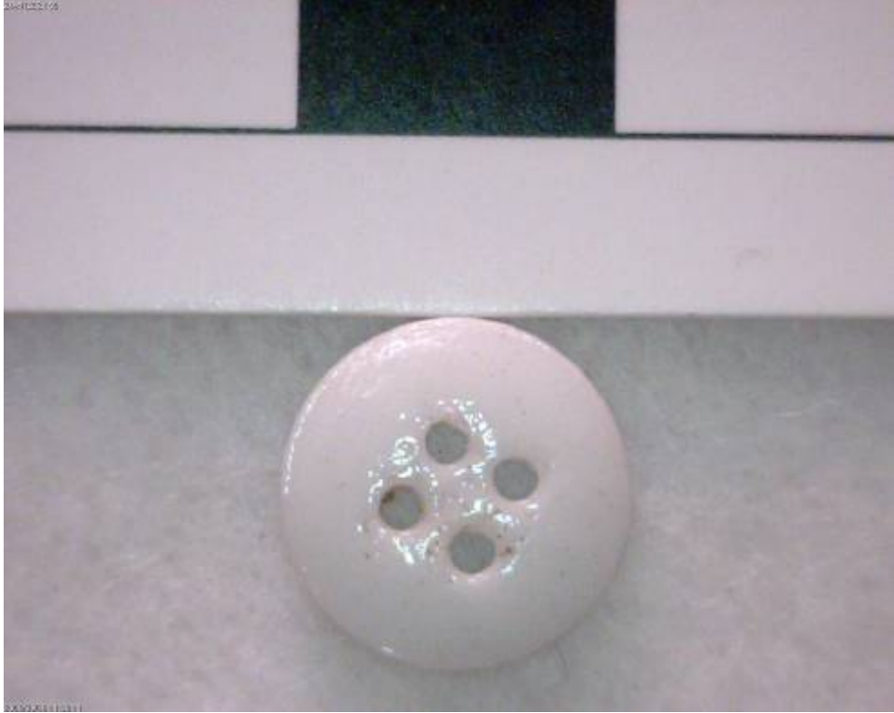
Porcelain “Prosser” buttons China Gulch, Hearth 1, Unit 3, Level 2 (10-20cm)

IT IS ILLEGAL TO REMOVE OR HARM ANY HISTORICAL OR ARCHAEOLOGICAL MATERIALS ON PUBLIC LANDS.