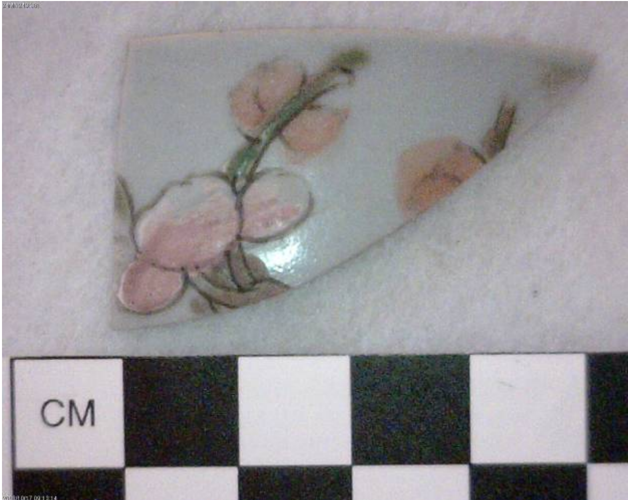
Chinese porcelain cup, “Four Season’s” design Louisville, Unit 5, Level 2 (10-20cm below surface)

IT IS ILLEGAL TO REMOVE OR HARM ANY HISTORICAL OR ARCHAEOLOGICAL MATERIALS ON PUBLIC LANDS.