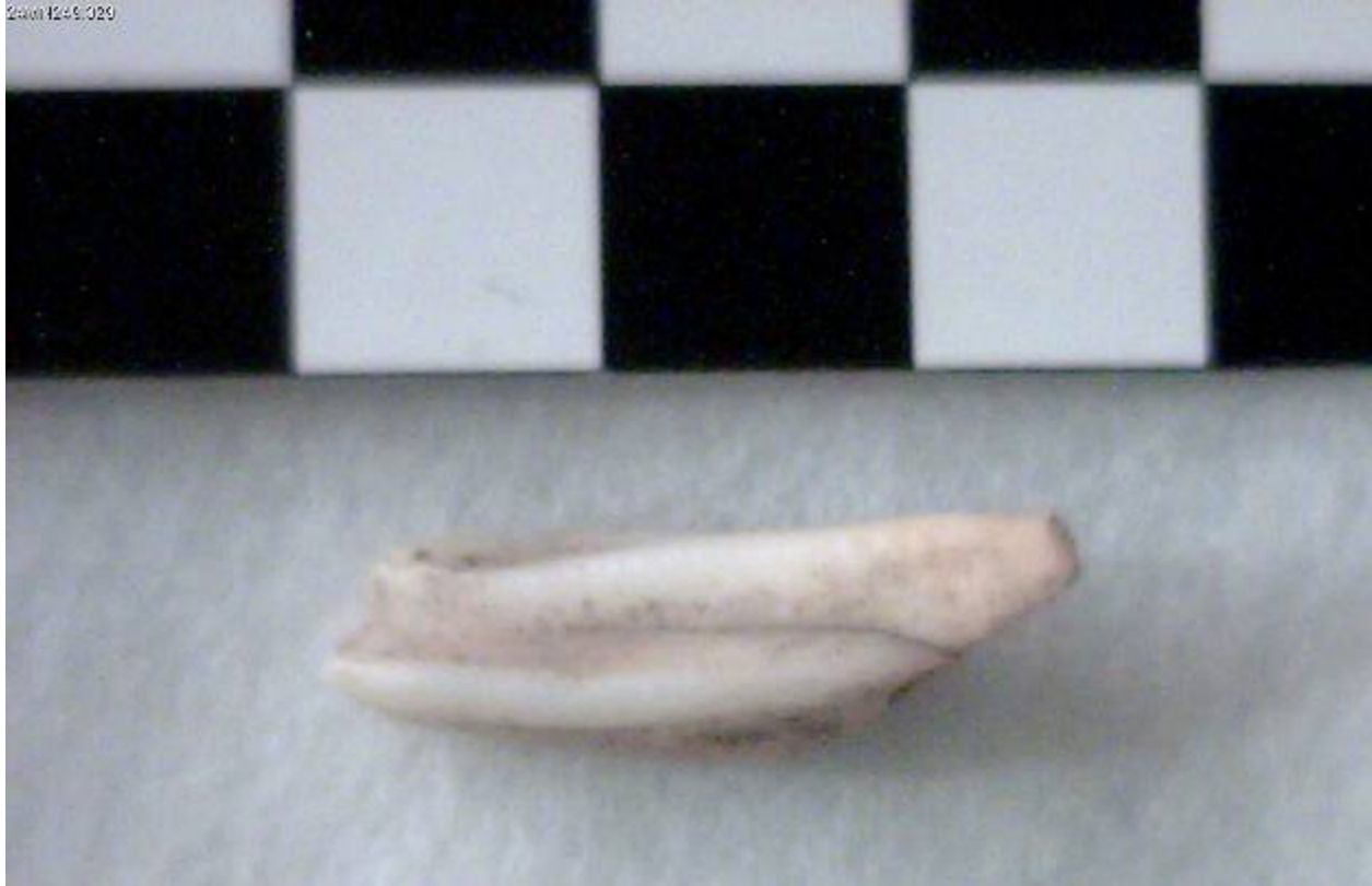
Domestic Pig Tooth, lower jaw Louiseville, Unit 5, Level 2 (10-20 cm below surface)

IT IS ILLEGAL TO REMOVE OR HARM ANY HISTORICAL OR ARCHAEOLOGICAL MATERIALS ON PUBLIC LANDS.