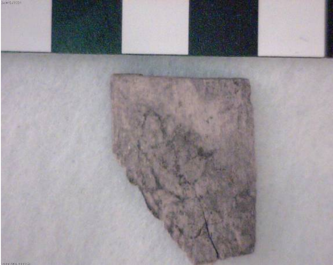
Rib Fragment, Shows Saw Marks on top edge Louiseville, Unit 6 Level 1 (0-10cm below surface)

IT IS ILLEGAL TO REMOVE OR HARM ANY HISTORICAL OR ARCHAEOLOGICAL MATERIALS ON PUBLIC LANDS.