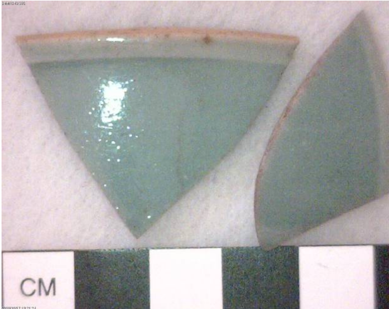
Chinese Celadon Bowl Fragments Louiseville, Unit 5, Level 2 (10-20cm below surface)

IT IS ILLEGAL TO REMOVE OR HARM ANY HISTORICAL OR ARCHAEOLOGICAL MATERIALS ON PUBLIC LANDS.