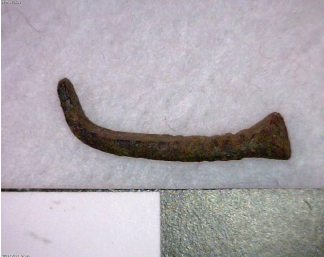
Brass Shoe Tack (probably held on a heel) Unit 5, Level 2 (10-20cm below surface)

IT IS ILLEGAL TO REMOVE OR HARM ANY HISTORICAL OR ARCHAEOLOGICAL MATERIALS ON PUBLIC LANDS.