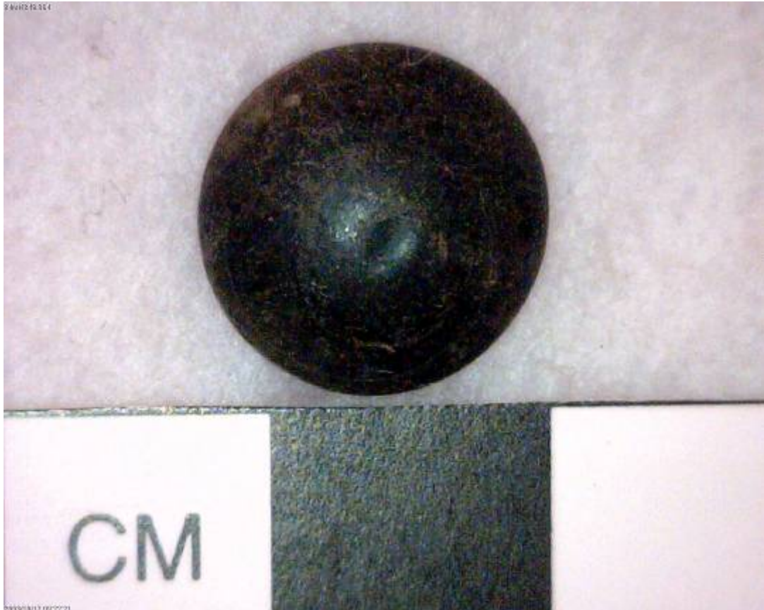
Black “Weiqi” or “Go” Piece Louiseville, Unit 5, Level 2 (10-20cm below surface)

IT IS ILLEGAL TO REMOVE OR HARM ANY HISTORICAL OR ARCHAEOLOGICAL MATERIALS ON PUBLIC LANDS.