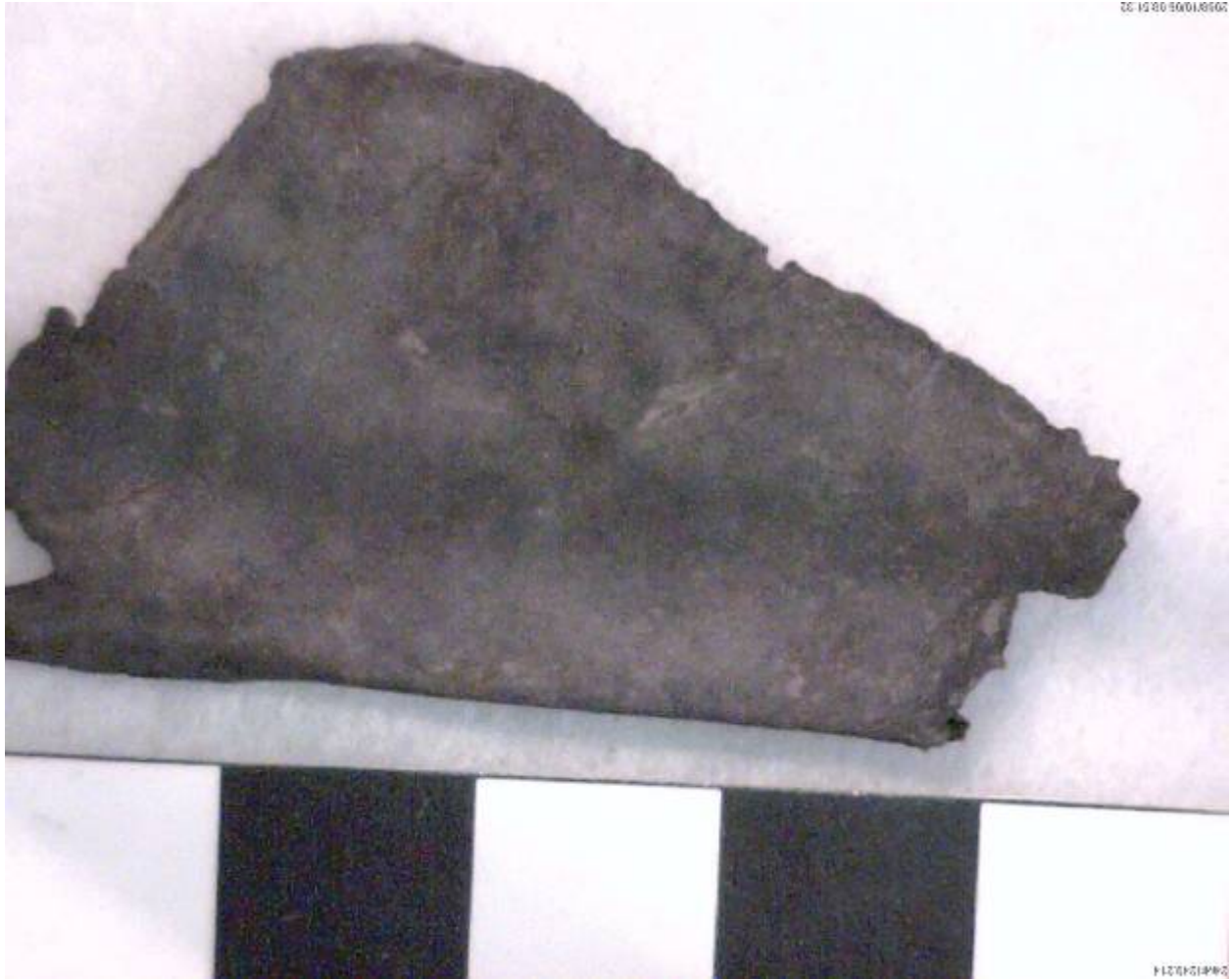
Fragment of Brass Opium Can Louiseville, Unit 6, Level 1 (0-10cm below surface)

IT IS ILLEGAL TO REMOVE OR HARM ANY HISTORICAL OR ARCHAEOLOGICAL MATERIALS ON PUBLIC LANDS.