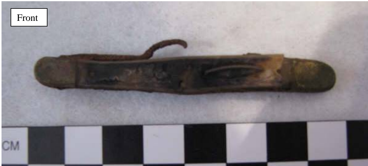
Pocket knife with tortoiseshell inlay Louisville, Unit 5, Level 2 (10-20cm)

IT IS ILLEGAL TO REMOVE OR HARM ANY HISTORICAL OR ARCHAEOLOGICAL MATERIALS ON PUBLIC LANDS.