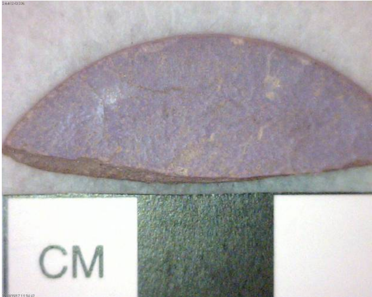
Half of a blue clay poker chip Louisville, Unit 6, Level 1 (0-10cm)

IT IS ILLEGAL TO REMOVE OR HARM ANY HISTORICAL OR ARCHAEOLOGICAL MATERIALS ON PUBLIC LANDS.