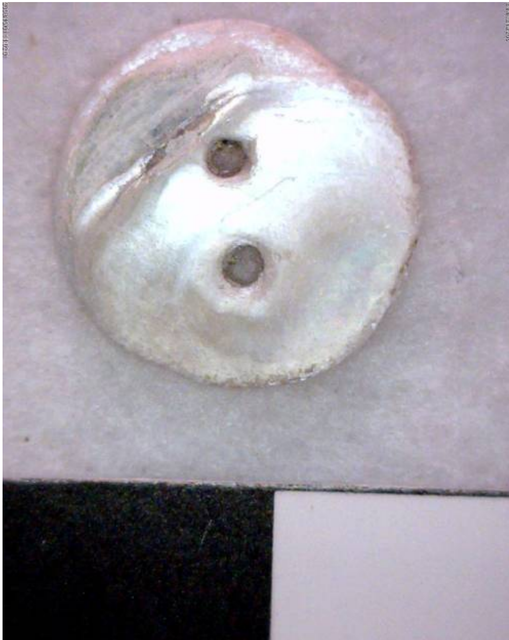
Mother-of-Pearl Shell Button Louisville, Unit 4, Level 2 (10-20cm below surface)

PLEASE HELP US ENSURE THAT ALL THE ARTIFACTS ON PUBLIC LANDS CAN TELL US THEIR STORY ABOUT THE PAST