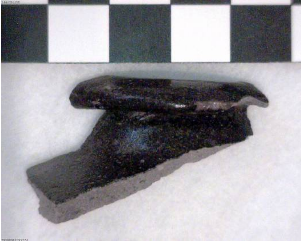
Filler Hole for a Chinese Spouted Jar (Soy Pot) Louiseville, Unit 6, Level 2 (10-20 cm below surface)

IT IS ILLEGAL TO REMOVE OR HARM ANY HISTORICAL OR ARCHAEOLOGICAL MATERIALS ON PUBLIC LANDS.