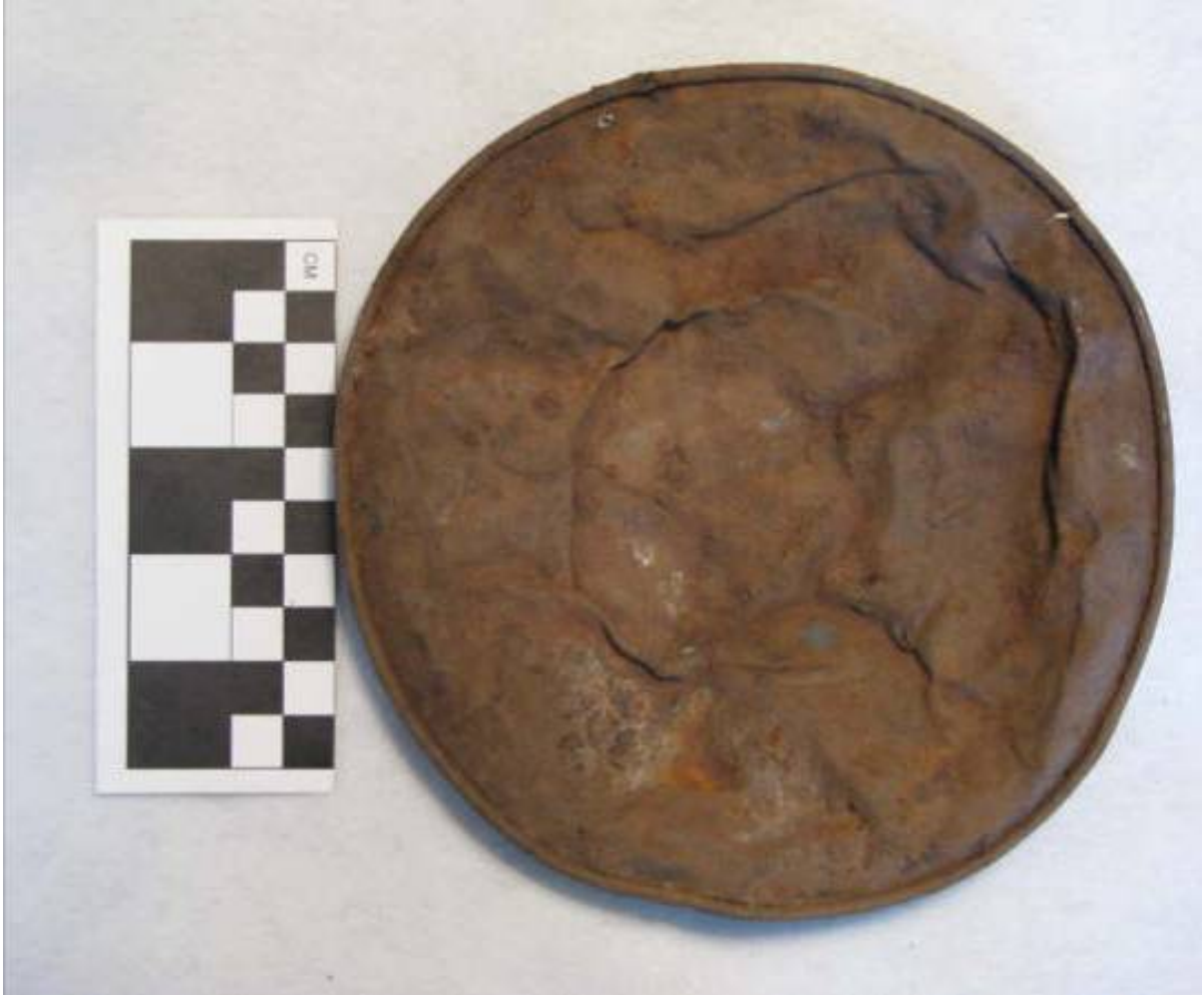
Enameled Tin Plate Louisville, Unit 5, Level 2 (10-20cm)

IT IS ILLEGAL TO REMOVE OR HARM ANY HISTORICAL OR ARCHAEOLOGICAL MATERIALS ON PUBLIC LANDS.