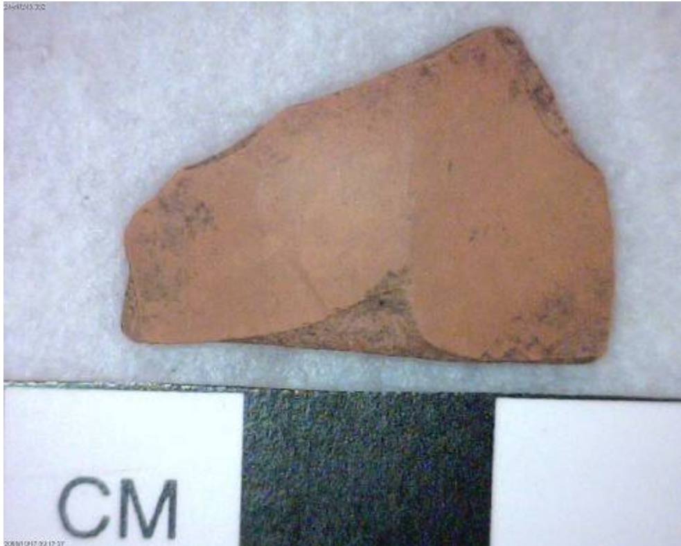
Opium Bowl Fragments (different styles of bowl) Louisville, Unit 5, Level 2 (10-20cm below surf.)

IT IS ILLEGAL TO REMOVE OR HARM ANY HISTORICAL OR ARCHAEOLOGICAL MATERIALS ON PUBLIC LANDS.